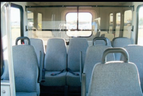
Standard spacious interior of the Xpress with mid-high seats, aisle mounted grab rails and armrests