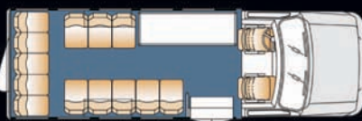
15 Passenger Aisle Facing with 72" Interior Luggage Rack 158" WB DRW