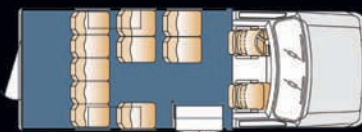
12 Passenger Plus Rear Luggage 138" WB SRW