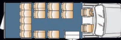
15 Passenger Plus Rear Luggage 158" WB DRW