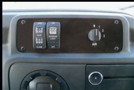
Conveniently located driver's switches on dash and not on engine cover