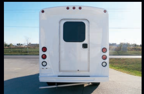
Stylish fiberglass rear cap with rear luggage access door